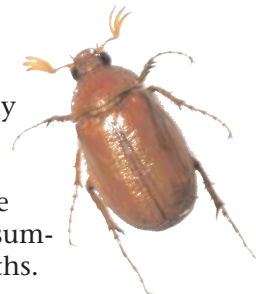
Figure 2. Adult white grubs, often called May or June beetles, are commonly attracted to lights at night.

The most important turfgrass-infesting white grubs in Texas are the June beetle, Phyllophaga crinita (Figure 2), and the southern masked chafer, Cyclocephala lurida . Warm season grasses like bermudagrass, zoysiagrass, St. Augustinegrass and buffalograss are attacked readily by both types of white grubs, with most lawn damage occurring during summer and fall months.