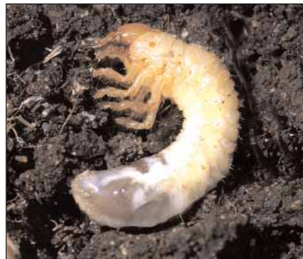
Figure 3. Turfgrass-infesting white grub larvae feeding on grass roots. Grubs are most damaging when they reach a length of \frac{1}{2} - to 1-inch.

Larva. White grub larvae are creamy white and C-shaped, with three pairs of legs (Figure 3). After hatching, the white grub passes through three larval life-stages, or instars. These instars are similar in appearance, except for their size. First- and second-instars each require about 3 weeks to develop to the next life-stage. The third-instar actively feeds until cool weather arrives. Third-instar larvae are responsible for most turfgrass damage due to their large size ( \frac{1}{2} to 1 inch-long) and voracious appetites. Feeding by large numbers of third-instar white grubs can quickly destroy turfgrass root systems, preventing efficient uptake of food and water. Damaged turf does not grow vigorously and is extremely susceptible to drying out, especially in hot weather.