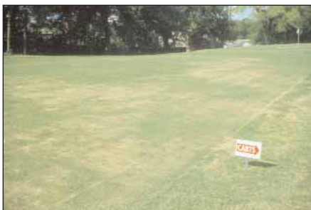
Figure 1. Golf course fairway damaged by white grubs.

White grubs, sometimes referred to as grubworms, injure turf by feeding on roots and other underground plant parts. Damaged areas within lawns lose vigor and turn brown (Figure 1). Severely damaged turf can be lifted by hand or rolled up from the ground like a carpet.