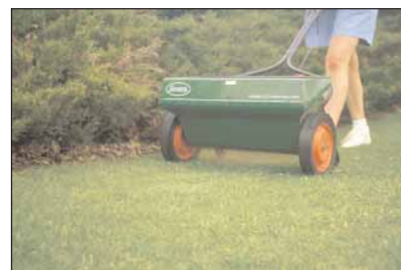
Figure 4. Drop-type spreaders allow precise placement of insecticide granules.

walks. Drop-type spreaders are less likely to scatter pesticide granules off of the target site than are rotary-type spreaders (Figure 4). Pesticide runoff from improper pesticide applications reduces the effectiveness of a treatment and can pollute above-ground and underground water supplies.