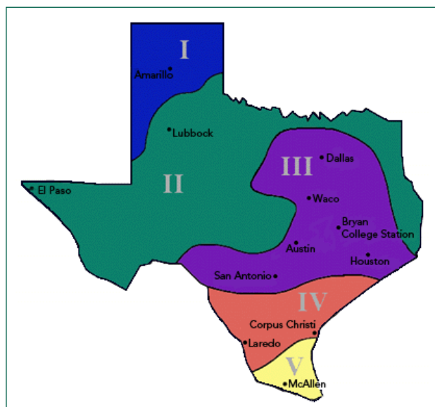
Figure 1. Gardening regions of Texas.